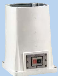
RES-330A Suitable model: • All REL model