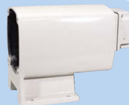
REF-330 Suitable model: • All REL model