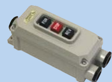
3-button switch Suitable model: • RES-330B • Attached to REF-330