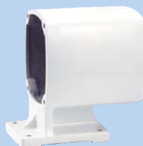
REF-300 Suitable model: • REL-2512 • REL-2524 • REL-4024 • REL-4024L