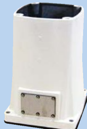
RES-330B with 3-button switch Suitable model: • All REL model